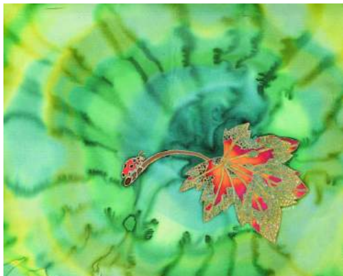
Wabi Sabi PT I